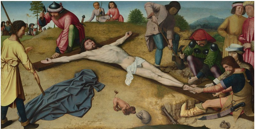
Gerard David 1481 Christ is nailed to the cross

“ and carrying his cross by himself, he went out to what is called ‘The Place of the Skull’, which in Hebrew is called Golgotha. There they crucified him”