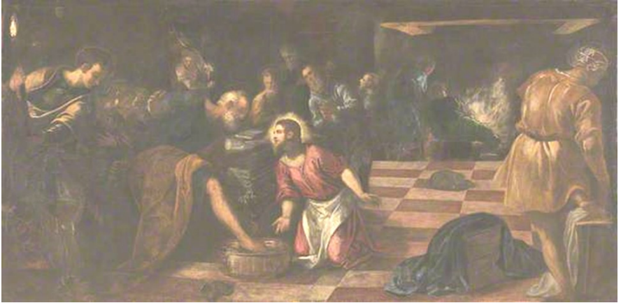
Jacopo Tintoretto 1584: Jesus washes the Disciples Feet

A tradition carried out in many churches on Maundy Thursday is that of the priest washing the feet of the congregation. This is to emulate Christ's actions in John 13 1-17. I wonder how many of you find this passage challenging—the idea of exposing your feet and actually letting your Priest wash them.. I know I do.